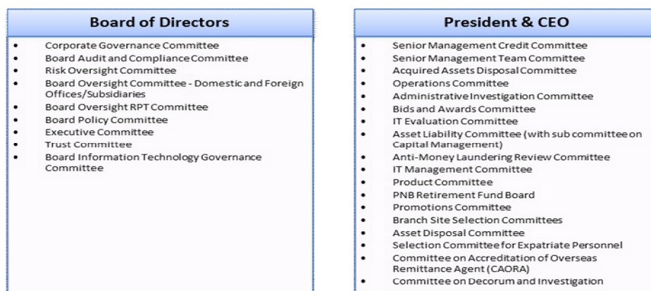
Figure 1: Board & Management Committees

The risk management framework of the Bank is under the direct oversight of the Chief Risk Officer (CRO) who is directly reporting to the Risk Oversight Committee. The CRO is supported by Division Heads with specialized risk management functions to ensure that a robust organization is maintained. The Risk Management Group is independent from the business lines and organized into the following divisions: Credit Risk Division, BASEL and ICAAP Implementation Division, Market & ALM Division, Operational Risk Division, Information Security / Technology Risk Management, Trust and Fiduciary Risk Division and Business Intelligence & Warehouse Division.