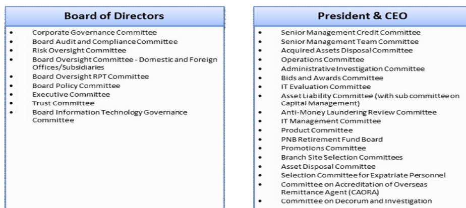
Figure 1: Board & Management Committees

The risk management framework of the Bank is under the direct oversight of the Chief Risk Officer (CRO) who is directly reporting to the Risk Oversight Committee. The CRO is supported by Division Heads with specialized risk management functions to ensure that a robust organization is maintained. The Risk Management Group is independent from the business lines and organized into the following divisions: Credit Risk Division, BASEL and ICAAP Implementation Division, Market & ALM Division, Operational Risk Division, Information Security / Technology Risk Management, Trust and Fiduciary Risk Division and Business Intelligence & Warehouse Division.